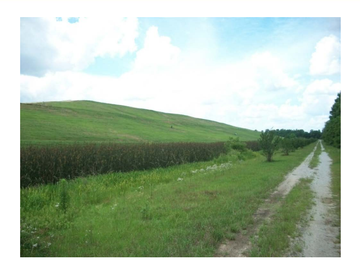
Properly closed Class I Landfill in Jackson County