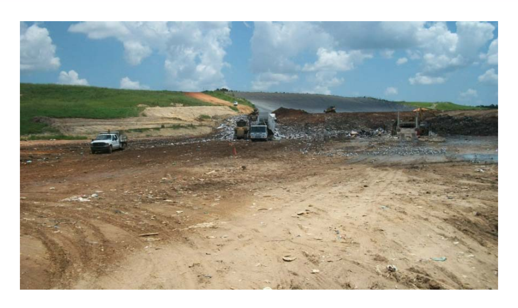
This Class I Landfill receives household garbage for disposal. Note liner on slope in background of photo.