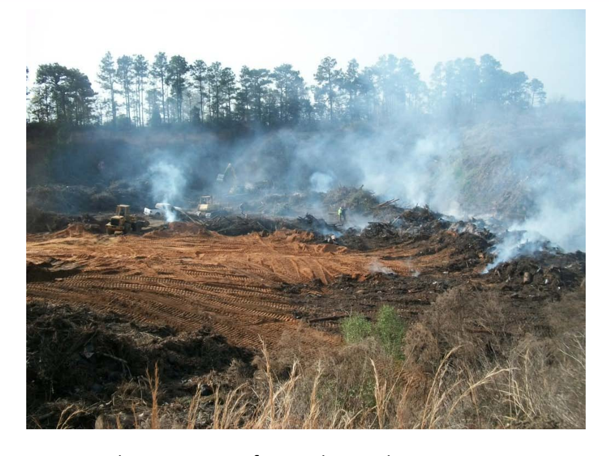
This is a recent fire at the yard trash disposal facility shown in the previous photo.