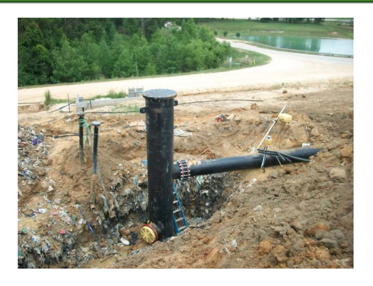
This is part of a landfill gas collection system at a Class I Landfill.